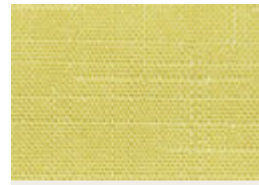
Morocco Soft Lime